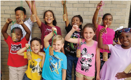
Children from the Anderson Area YMCA After School Program

The Anderson Area YMCA After School Program has over 600 children each school day. With the funding from the United Way through the DSS Childcare Grant the YMCA is able to provide quality after school care and touch many lives throughout our community.